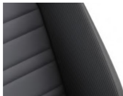
"Carbon-Flag"/Vienna (W05) Flint Grey/Titan Black (OK) Optional on R-Line models

Note 1: Some parts of leather interior trim will contain artificial leather. Note 2: The print processes do not allow exact reproduction of the upholstery & insert colours.