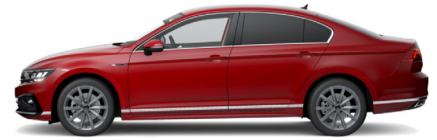
Tornado Red Solid* G2G2