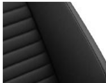
"Nappa" leather (WL7) Titan Black/Blue(TO) Optional on Elegance/ R-Line models