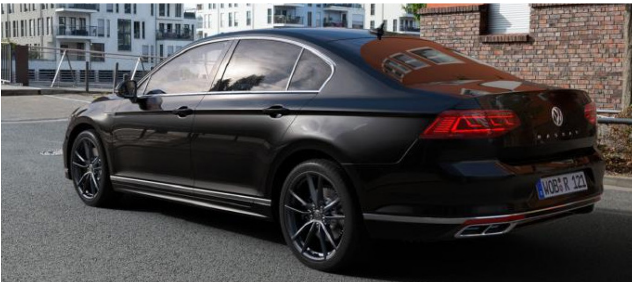
Note: The above image shows 'R-Line' Model with optional 'Pretoria' 19" alloy wheels in optional Matte Dark Graphite paint and optional Matrix LED package.

The above specifications are for information purposes only as our products are continually updated and changes may be made to the specifications at any time. If you require any specific feature, you must consult your local dealer who is regularly updated with any change in specification. Specifications are subject to change without notice. Effective from 01 October 2021, for production from CW25/2021 onwards. All prices include VAT and VRT. These prices are subject to change once technical data comes available.