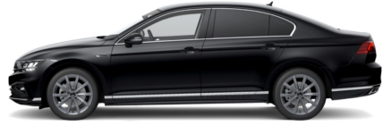
Deep Black Pearl Effect* 2T2T