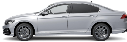
Pyrite Silver Metallic* K2K2