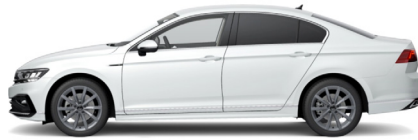
Oryx White Pearl Effect* 0R0R Note: Not available on Passat and Passat Business models