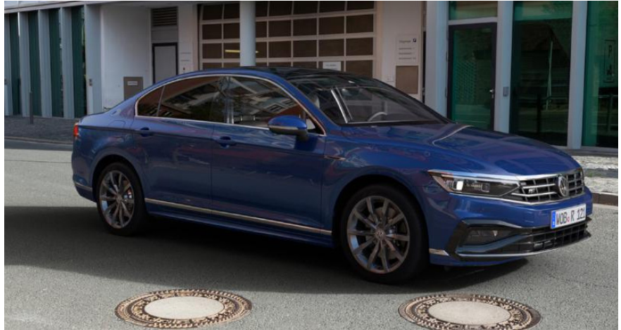
Note: The above image shows 'R-Line' in Lapiz Blue with 'Monterrey' 18" alloy wheels in Grey Metallic and optional Matrix LED package.