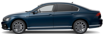
Aquamarine Metallic* 8H8H