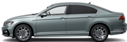
Scale Silver Metallic* 1T1T