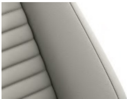
"Vienna" leather (WL1) Mistral (YR) Optional on Business models