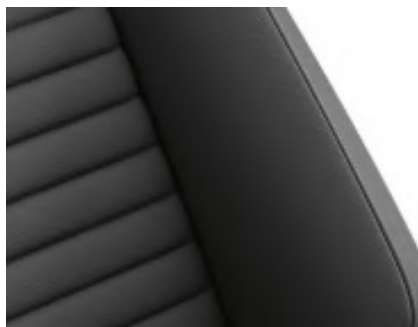
"Vienna" leather (WL1) Titan Black/Blue (TO) Optional on Business models