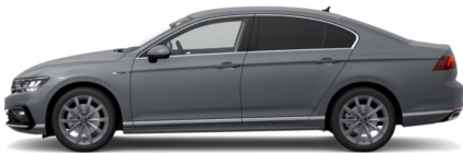
Moonstone Grey Solid C2C2