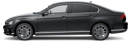
Manganese Grey Metallic* 5V5V