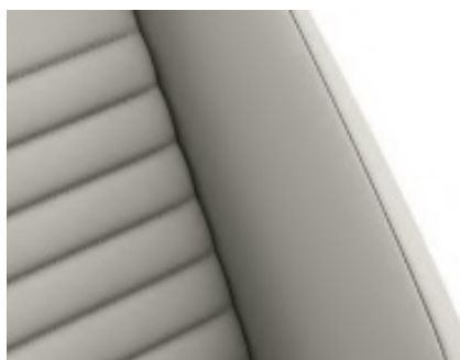
"Nappa" leather (WL7) Mistral (YR) Optional on Elegance and R-Line models