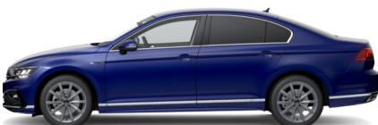
Lapiz Blue Metallic* L9L9 Note: Only available on R-Line Models

Note: Oryx White is a premium pearl effect paint finish. Please see Options section for pricing information. * Optional at extra cost · Please note, the print processes do not allow exact reproduction of the paint colours.