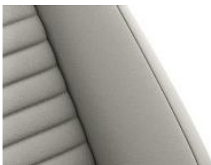
"Alcantara"/ "Vienna" leather Mistral (YR) Standard on Elegance/ R-Line models