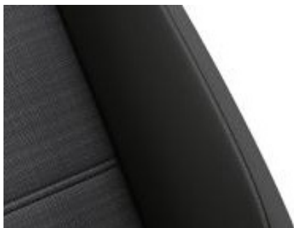
"Weave" cloth Titan Black/Blue (TO) Standard on Business models