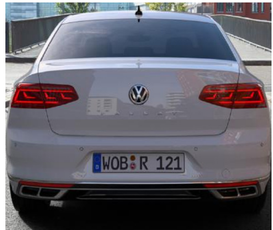
Note: The above image shows 'R-Line' Model with optional Matrix LED package.