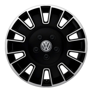
17" 'Posada' Optional on Comfortline

7J x 17, Silver Tyres 215/60 R17 C 109/107T