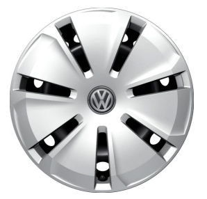
16" Steel Wheel (incl. trim) Standard on Comfortline

6.5J x 16, Silver Tyres 215/60 R17 C 109/107T