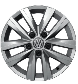
16" 'Clayton' Optional on Comfortline

6.5J x 16, Silver Tyres 215/60 R17 C 109/107T