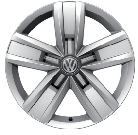
17" 'Devonport' Optional on Comfortline

7J x 17, Black Tyres 215/60 R17 C 109/107T