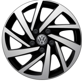
17" 'Woodstock' Optional on Comfortline 7J x 17, Black

6.5J x 16, Silver Tyres 215/60 R17 C 109/107T