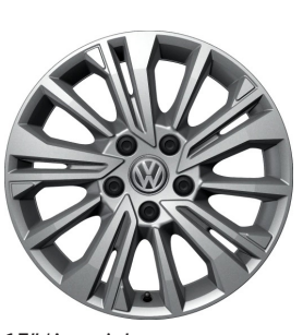
17" 'Aracaju' Optional on Comfortline

7J x 17, Silver Tyres 215/60 R17 C 109/107T